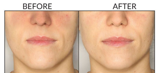
PDT BLACK ESSENTIAL ANTI-REDNESS Serum in a combined therapy using RED STOP Reduction of erythema and dilated capillaries; brightened skin tone after 4 treatments performed once a week