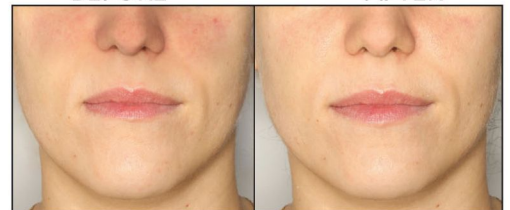
PDT BLACK ESSENTIAL ANTI-REDNESS Serum in a combined therapy using RED STOP Reduction of erythema and dilated capillaries; brightened skin tone after 4 treatments performed once a week