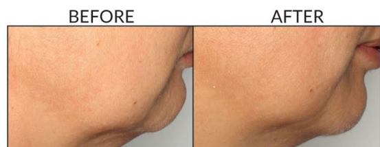
LIFT PEPTANGO R peptide ampoule concentrate 25% in the treatment procedure using PDT method. Improved face oval after 5 treatments performed once a week